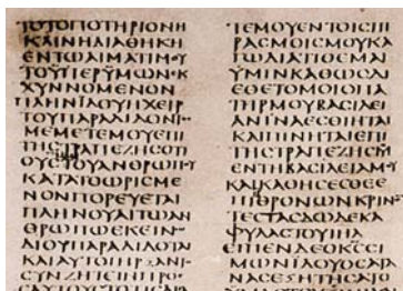
The oldest complete New Testament» Written in Greek by three scribes in the 4th century

A number of major grants have been made this year to support the Codex Sinaiticus Project, an international collaboration to conserve and digitise the world's oldest Bible. These included awards from the Arts and Humanities Research Council, Deutsche Forschungsgemeinschaft, AG Leventis Foundation, the American Friends of Saint Catherine's Monastery and an anonymous trust. The awards enabled us to more than match the Stavros S Niarchos Foundation's £150,000 challenge grant. A Royal Gala Dinner is being held in June 2006, in partnership with the Saint Catherine Foundation, to complete the appeal.