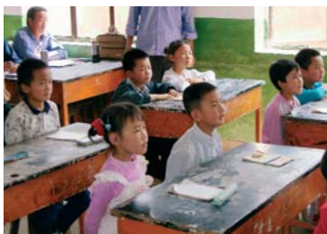
IDP resources are used in schools» Chinese schoolchildren learn about their heritage

The Ford Foundation has awarded a substantial grant to the International Dunhuang Project (IDP) to enhance significantly our connections with partners in China, India and Russia. As well as enabling 10,000 items from their collections to be catalogued, digitised and added to IDP's online database, the grant will also help us develop the research skills and networks of scholars in these regions, and will pump-prime the foundation of an IDP Centre in India. Further funding is now being sought to conserve, catalogue and digitise the remainder of our Silk Road collections and to introduce new resources for schools and colleges.