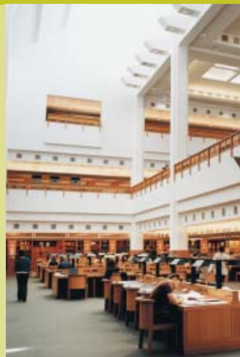
The Humanities Reading Room British Library, St Pancras, London