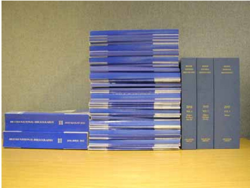
One year's printed BNB

After a number of technical problems were overcome, a proper BNB catalogue card service commenced in June 1956, with cards available for all entries published since the previous January. A weekly BNB MARC exchange tape service began as early as January 1969 and BNB MARC records were made available online with the introduction in 1977 of BLAISE (British Library Automated Information Service).