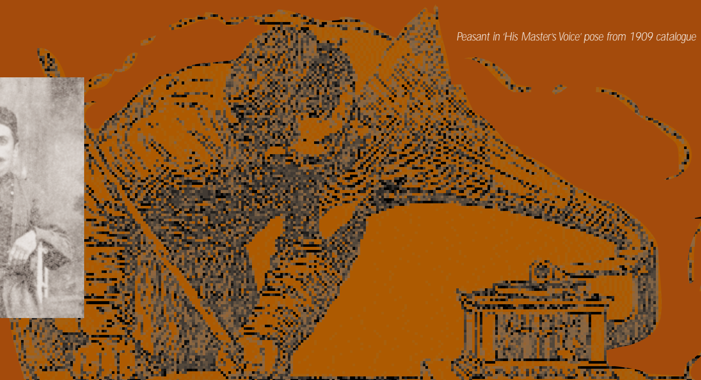
Peasant in 'His Master's Voice' pose from 1909 catalogue

Turkestan (Xinjiang) via Bukhara (at that point still the capital of a nominally independent emirate), Samarkand, Tashkent, and various other smaller towns. The precise route through Turkestan seems somewhat haphazard, until considered on a contemporary map, where we can see that he was following the only extant railway in the region.