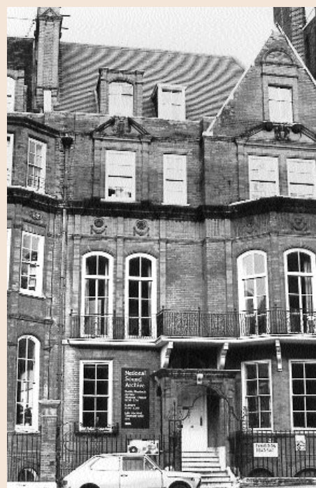
The NSA's former home in South Kensington

■ The British Library has sold 29 Exhibition Road, London SW7, the former home of the NSA, to a private buyer for more than £3 million. The property, a fine Grade II listed building close to the Royal Albert Hall, was built in the 1870s and from the 1950s housed the British Institute of Recorded Sound, which became the National Sound Archive when it was incorporated into the British Library in 1983. Proceeds from the sale will be used to implement the development plans of the NSA, which include the digitisation of historic recordings and improving access using digital technology.