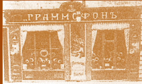
The Gramophone Company shop in Tbilisi

the latter. The recordists were aware that the acoustic technology of the time could pick up and reproduce strong voices much more effectively than it could most musical instruments, and so relatively few instrumental titles were recorded. The relative lack of female vocal recordings, at least in Turkestan, may be partly illuminated by the following excerpt from Fred Tyler's memoirs: 'To obtain women's voices it was sometimes necessary to make records in their own quarters, as, being Mohammedans, they could not visit a public caravanserai with propriety. In order, therefore, to avoid scandal, we sometimes packed all our equipment on a cart and set out after dark to set up our studio in the woman's house.'