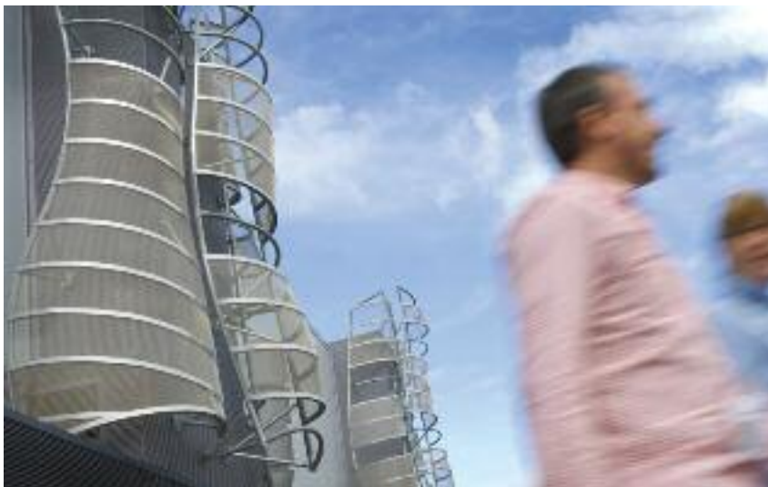
Images above: Image taken from Canterbury Tales by Geoffrey Chaucer. Published and produced by William Caxton. London, 1485. Image taken from Collected Works of Christine de Pisan. Published and produced in France 1410–1411. Inside our Evolving English exhibition, Image of the Additional Storage Building (ASB) in Boston Spa