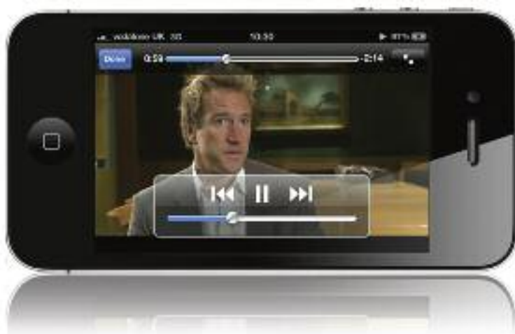
Images above: St Pancras building exterior. British Library Treasures App for iPhone, iPad and Android smartphones.