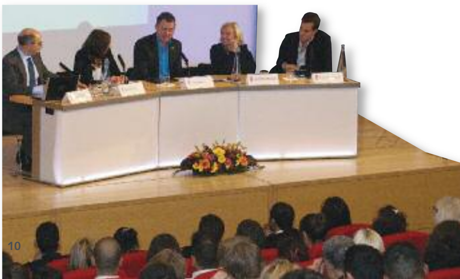
Image left: BIPC panel event , 'Question Time for Entrepreneurs' in 2010.